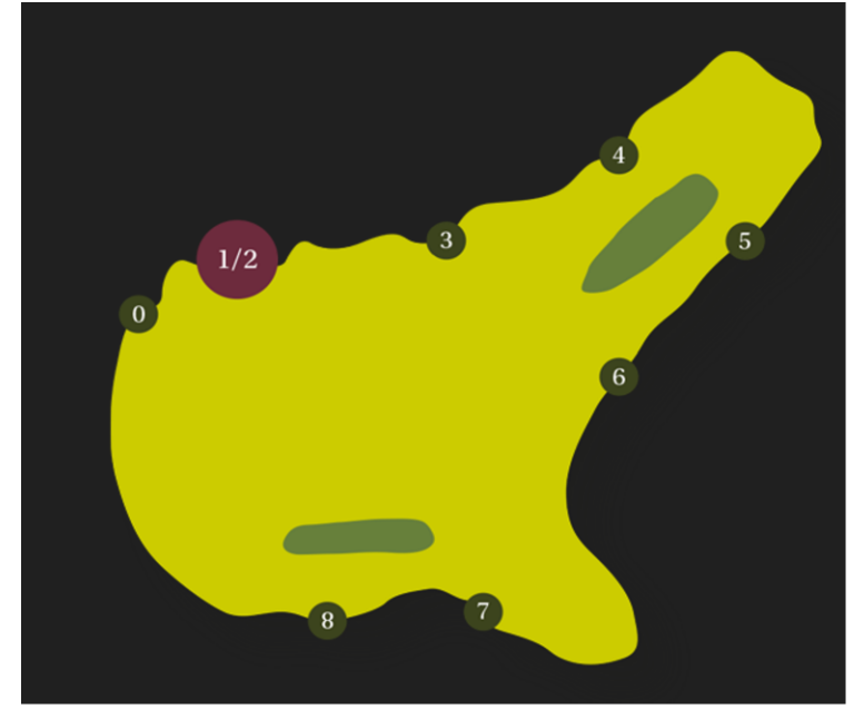
Specimen 2 (This lake is NOT Free, but is fishable at a £2 reduction)

Specimen 1 (This lake is NOT Free, but is fishable at a £2 reduction)